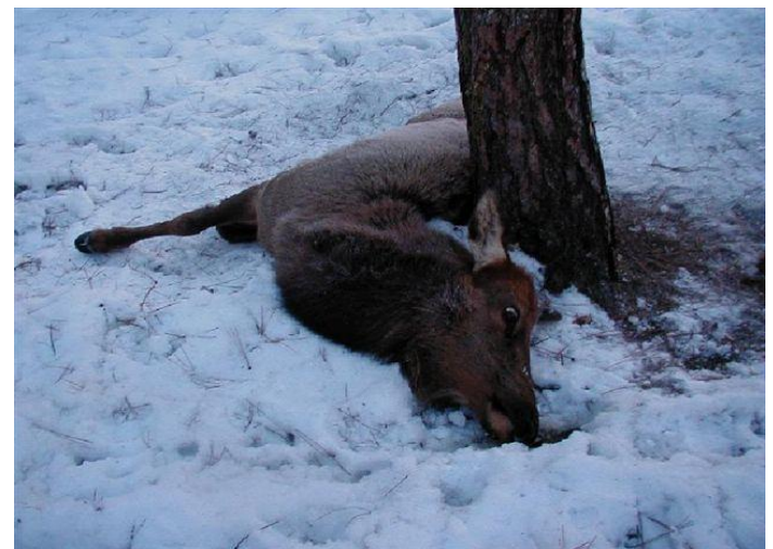
Elk can forage in deeper snow than mule deer but they cannot survive on a diet of pine needles (2002 Garden Valley photo).

When an animal has lost fat and muscle tissue totaling 20-25% of its optimum body weight, its odds of surviving are poor, even if adequate nutrients are provided at that point. Ideally, emergency feeding should begin long before that advanced stage of malnutrition is reached.