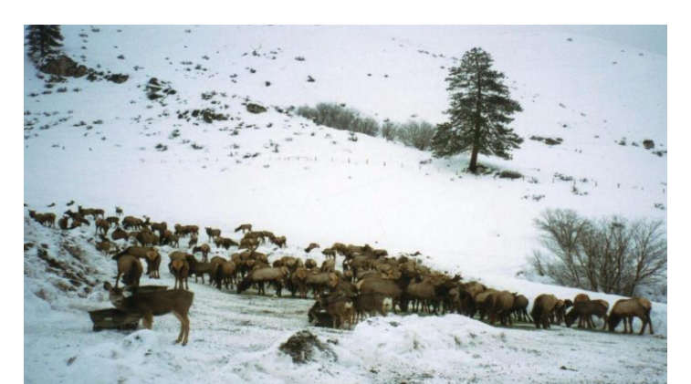
Part of 433 elk and deer fed at the Donley site in 1992-93 winter.

Pressure from hunters during extended hunting seasons often displaces both deer and elk, forcing them to occupy areas outside of their normal winter range. This sometimes results in their joining local herds and creating larger concentrations than would normally occur.