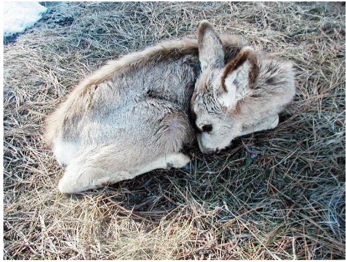
The 2001-02 winter in Garden Valley resulted in the second highest snowfall in 50 years yet IDFG abruptly cut the feed in half in mid January. This starving fawn, at the bottom of the "pecking order", could no longer get enough feed and died on a pile of yellowpine needles as the slopes began to bare in March.

breeding age males and replacement juveniles by refusing to feed them enough to survive.