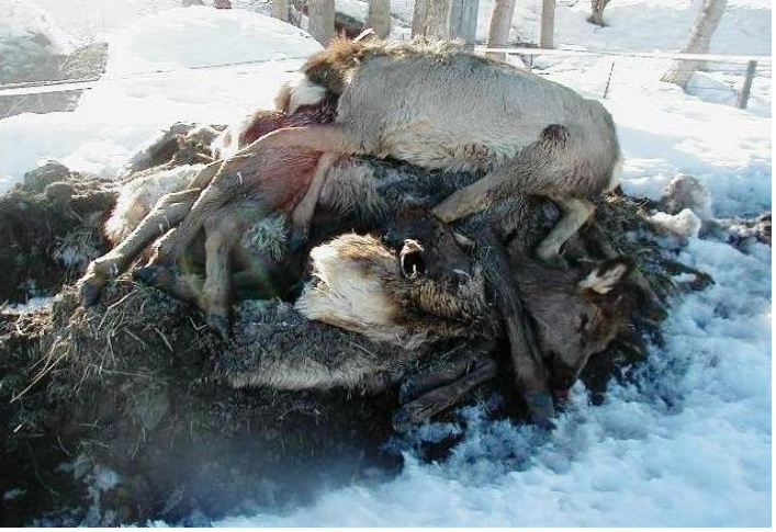
Dead elk IDFG refused to feed in Garden Valley in 2001-02 winter.

In 1927, Sparkman reported seeing more deer and elk in the Lowman Game Preserve (Unit 35), and many times more deer outside the game preserve in Unit 33 than exist there today. From the late 1920s through the 1940s, USFS estimates of total deer wintering along the South and