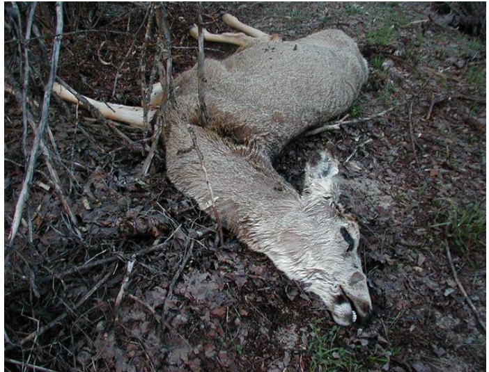
Female mule deer in Garden Valley starved to death above feed sites after IDFG cut feed in half during mid January 2002. Like many others, this animal died when slopes were baring up, shortly after additional feed reduction on March 1<sup>st</sup>..