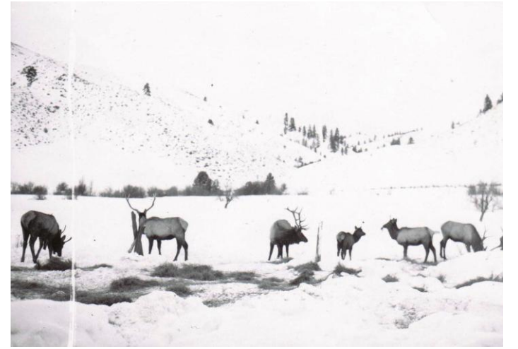
Elk fed properly by IDFG in Garden Valley during 1948-49 wiinter.

Early reports from the State Game Warden to Idaho's elected officials reveal that emergency feeding of deer and elk during an abnormally severe winter was an important biological tool used to restore big game populations. IDFG records in my files document F&G cutting evergreen boughs to feed whitetails in north Idaho, as well as significant emergency winter hay feeding to mule deer and elk in every Region.