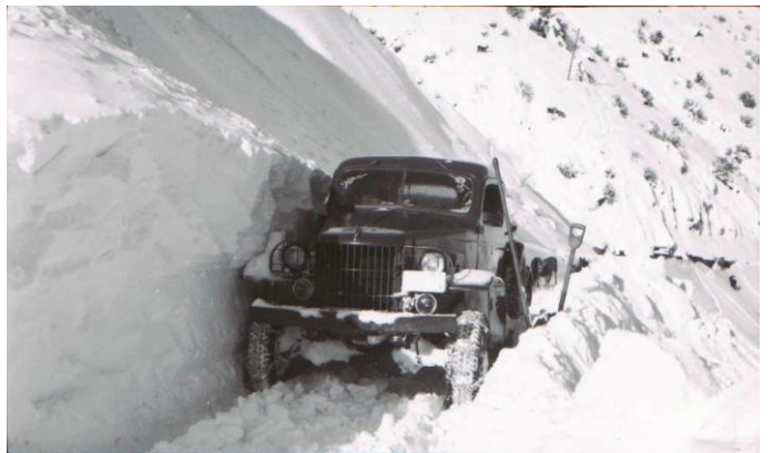
Deer and elk were fed properly during the 1948-49 winter, with feed spread out to provide every animal access.

When the snow melted in the spring, IDFG counts identified only 124 deer that died from all causes, far fewer than were found in a normal winter. Both the Department and local citizens considered the operation a success.