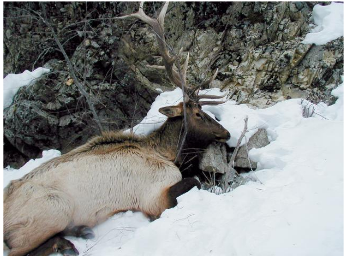
6-point bull elk near death with its fat reserves used up and its rumen full of indigestible woody branches on March 9, 2002. This is one of several hundred elk that died in the Garden Valley area when IDFG and USFS prohibited feeding by private citizens on public lands during the 2001-02 winter.

But if the animals are exposed to excessive rain and wind, sub zero temperatures, abnormal snow depths requiring them to search for food, or harassment by predators or humans, their normal winter daily energy requirement can increase by 75%-150% or more. This exceeds their ability to make up the deficit with stored body fat and they will eventually die unless they are fed or provided energy supplements.