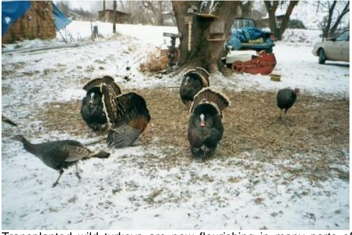
Transplanted wild turkeys are now flourishing in many parts of Idaho due to cooperative efforts between the Turkey Federation and private landowners who voluntarily feed them when winter conditions prohibit their survival without feeding.

As this issue of The Outdoorsman goes to press, a proposed Constitutional amendment purported to protect harvest by hunting, fishing and trapping has already passed the Idaho House. Unfortunately the lawful mandate to provide continued supplies of wildlife has been changed to provide only "hunting opportunity " in the proposal.