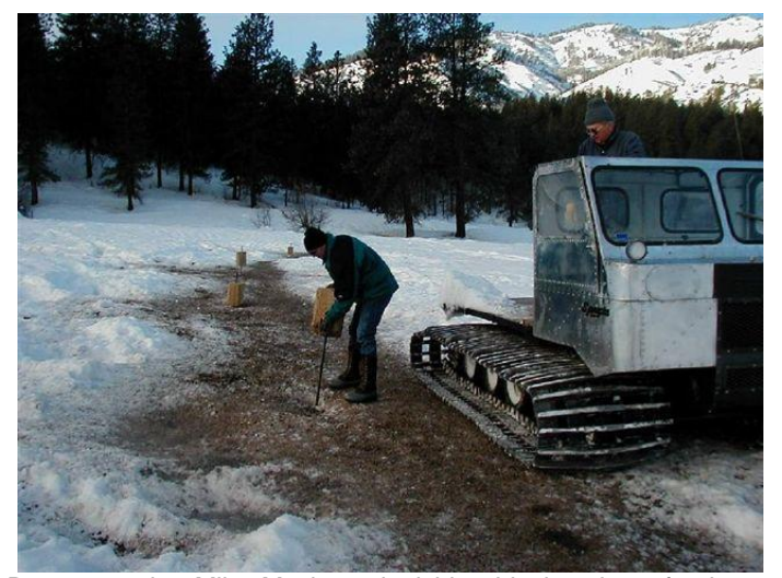
Representative Mike Moyle replenishing blocks where feed was withdrawn from 200 elk by IDFG.

Early use of wildlife energy supplement blocks can compensate, to some degree, for errors in judgment on when to start emergency feeding.